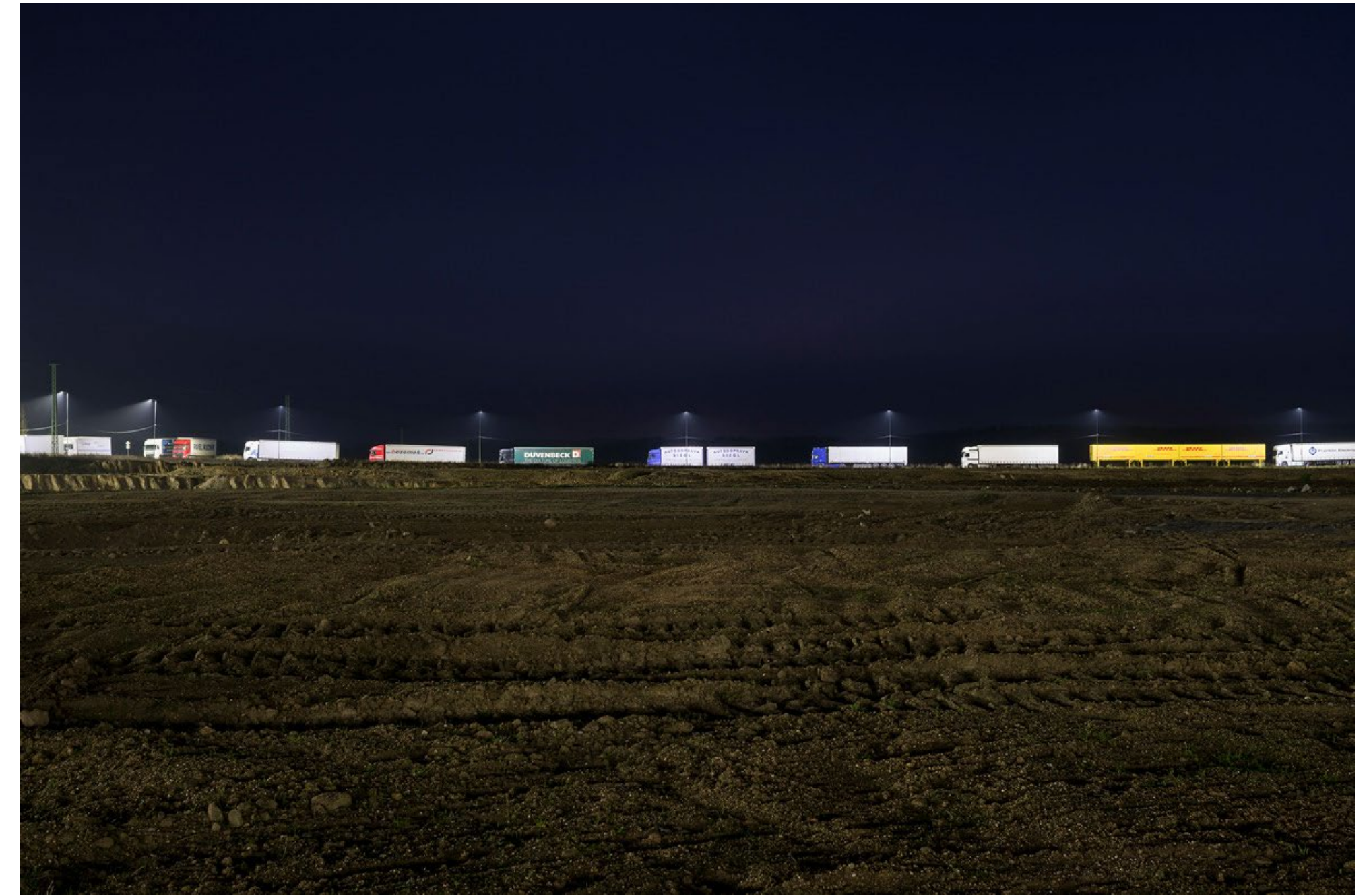
Img. 2 - Warehouse goods logistics (Steel cities)

The mobility of the population and goods causes the view of the planet as one sophisticated logistics network. The construction of infrastructure seems to be a necessary part of the company's development. The necessary construction seems to be a major intervention in the existing urban and landscape environment, making it a strong topic for an active approach.