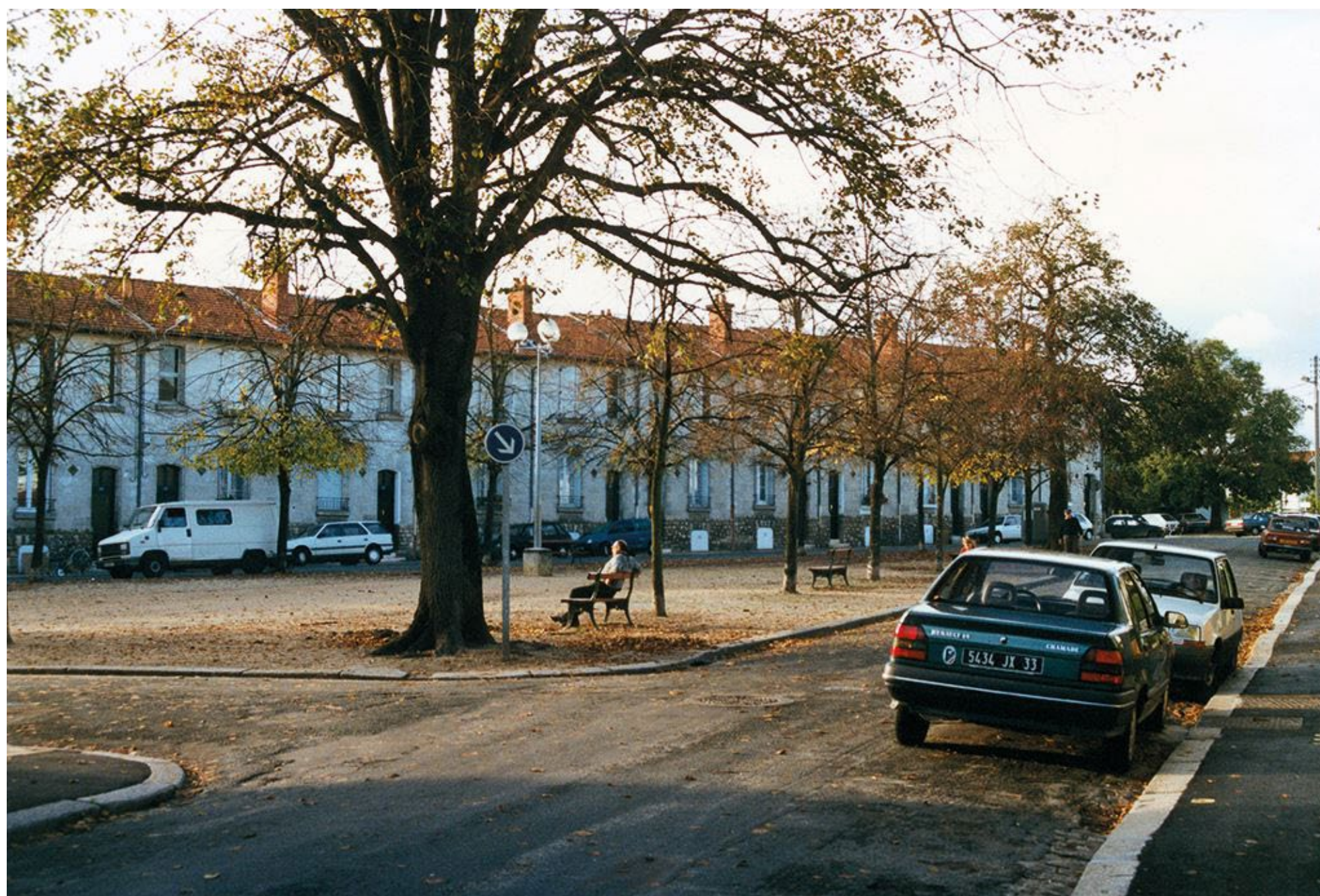
Img. 3 - Place Léon Aucoc, Bordeaux (Lacaton Vassal)